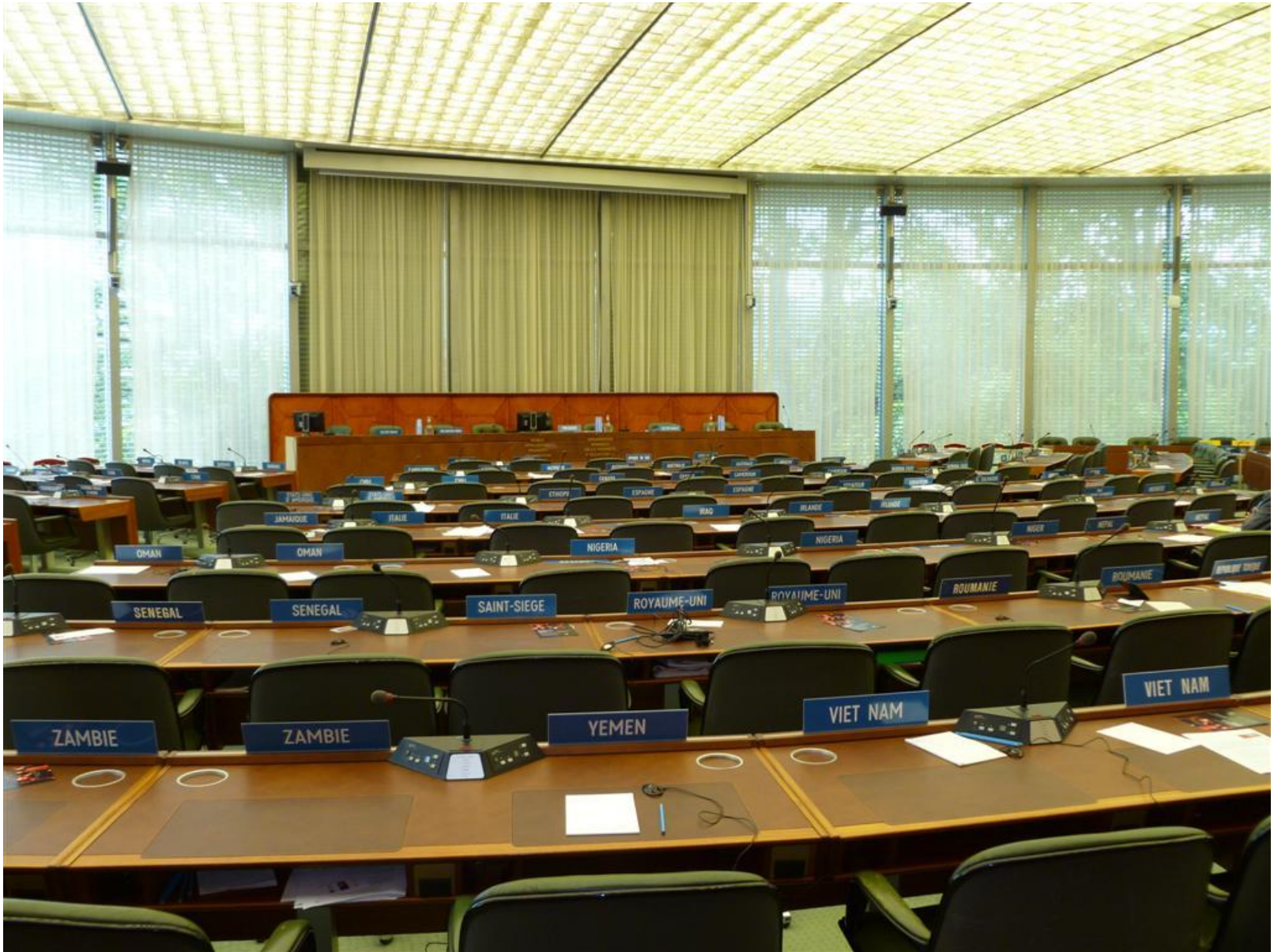
Max-Planck-Institut für ausländisches öffentliches Recht und Völkerrecht