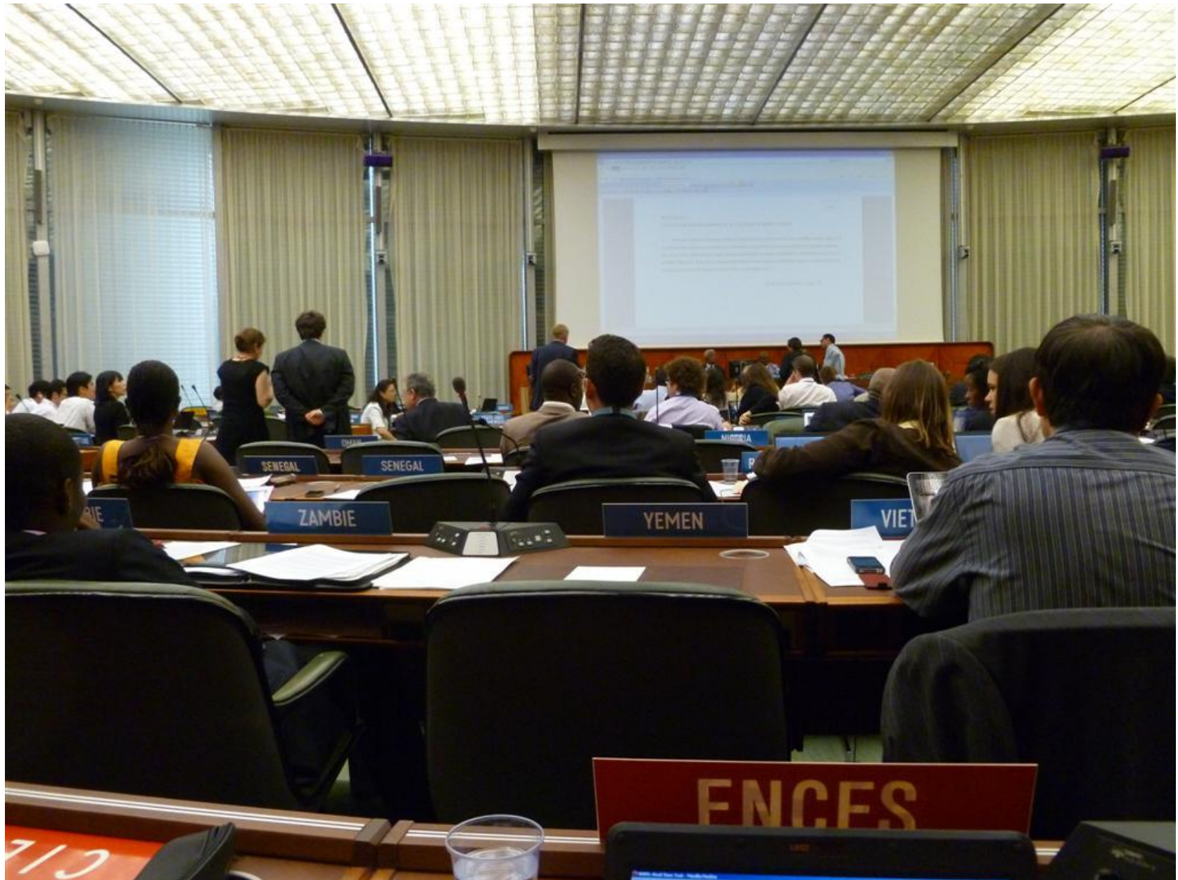
Max-Planck-Institut für ausländisches öffentliches Recht und Völkerrecht